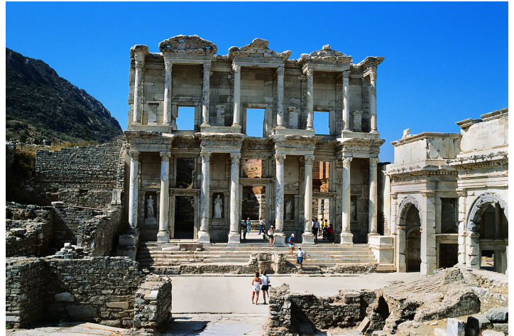
The Library of Celsus (ca. 117-120 CE) in Ephesus, Turkey, alongside the entrances has statues of four virtues: goodness, thought, knowledge, and wisdom