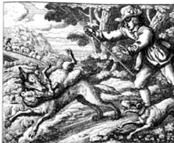
"The Boy who Cried Wolf," illustration by Francis Barlow, from Aesop's Fables, illustrated by Francis Barlow (1687).

an English translation along with the Latin text, a digital facsimile of the page from Barlow's 1687 publication of Aesop's Fables . When the website is finished this summer, there will also be video slide shows for many fables, quizzes, questions for oral discussion in Latin, a crossword puzzle based on the vocabulary for each fable, as well as a history of the interpretation of each fable. Visit http://aesopus.ning.com/ for access to Aesop's Fables and the rich resources there.