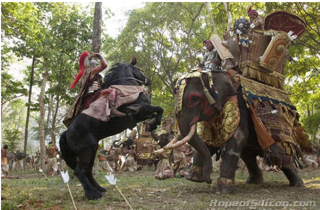
Meeting of horse and elephant at the Battle of Hydaspes, from Oliver Stone's Alexander

(Continued from page 3) the most part, accurate in detail. This includes graphic violence, so be forewarned. The army is shown to be very well drilled, and Stone portrays this, correctly, I think, as an important component of their cohesion and morale. Words attributed to Alexander make their way