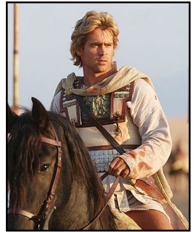
Colin Farrell as Alexander in Oliver Stone's Alexander (2004)