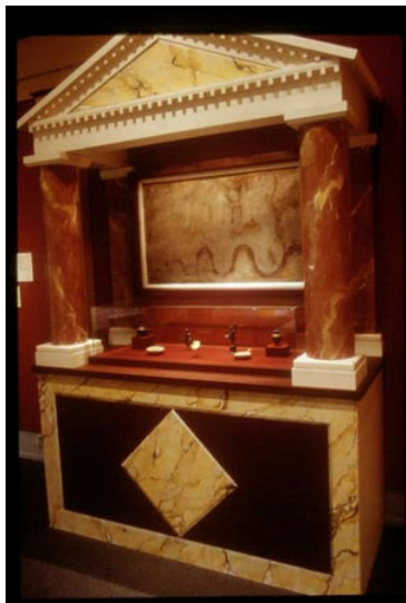
A Lararium—a shrine to the household gods—graces the atrium of the reconstructed Roman house at “Art in Roman Life: Villa to Grave,” Cedar Rapids Museum of Art