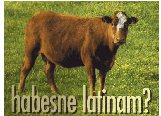
This cow responds to the "Got Milk?" campaign with "Got Latin?"

Yet as Latin gradually yielded its position of importance as a vehicle of communication, especially in the nineteenth and twentieth centuries, Waquet argues that Latin became less a language and more a "sign denoting