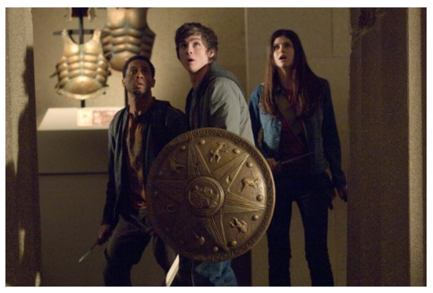
L to R: Grover (a satyr), Percy Jackson (aka Perseus), and Annabeth (daughter of Athena) go in quest of the helm of darkness stolen to initiate an epic sized quarrel among the gods of Olympus in Percy Jackson and the Olympians: The Lightning Thief (Twentieth Century Fox)

It's the 21st century, but the gods of Mount Olympus and assorted monsters have walked out of the pages of high school student Percy Jackson's Greek mythology texts and into his life. And they're not happy: Zeus' lightning bolt has been stolen, and Percy is the prime suspect. Even more troubling is the sudden disappearance of Percy's mother. As Percy finds himself caught between angry and battling gods, he and his friends embark on a cross-country adventure to catch the true lightning thief, save Percy's mom, and unravel a mystery more powerful than the gods themselves.