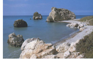
Shore where Aphrodite was born, Paphos, Cyprus

inland, at Paphos, her temple erect on the ruined marble floor paving amid column chunks and cringing olive trees as the horizon trembled in haze