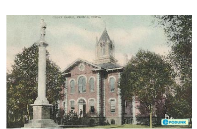
Cresco, lowa, the country seat of Howard County, est. pop. 3840