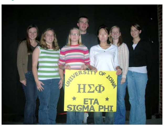
The Caristia website features this photo of University of Iowa students who are members of Eta Sigma Phi, the Classics Honorary Society

Local colleges, Augustana College and Cornell College are reaching out, too. Learn about Augustana's two innovative programs, Ecclesia and Latin Omnibus, helping make connections in the Quad Cities between the community and their students. And Cornell College celebrated 2005 as The Year of Languages with a multicultural conference that attracted more than 270 high school students to learn about languages,