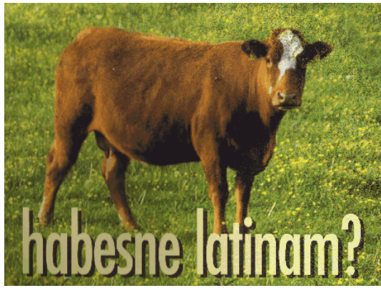
This cow responds to the "Got Milk?" campaign with "Got Latin?"

Yet as Latin gradually yielded its position of importance as a vehicle of communication, especially in the nineteenth and twentieth centuries, Waquet argues that Latin became less a language and more a "sign denoting